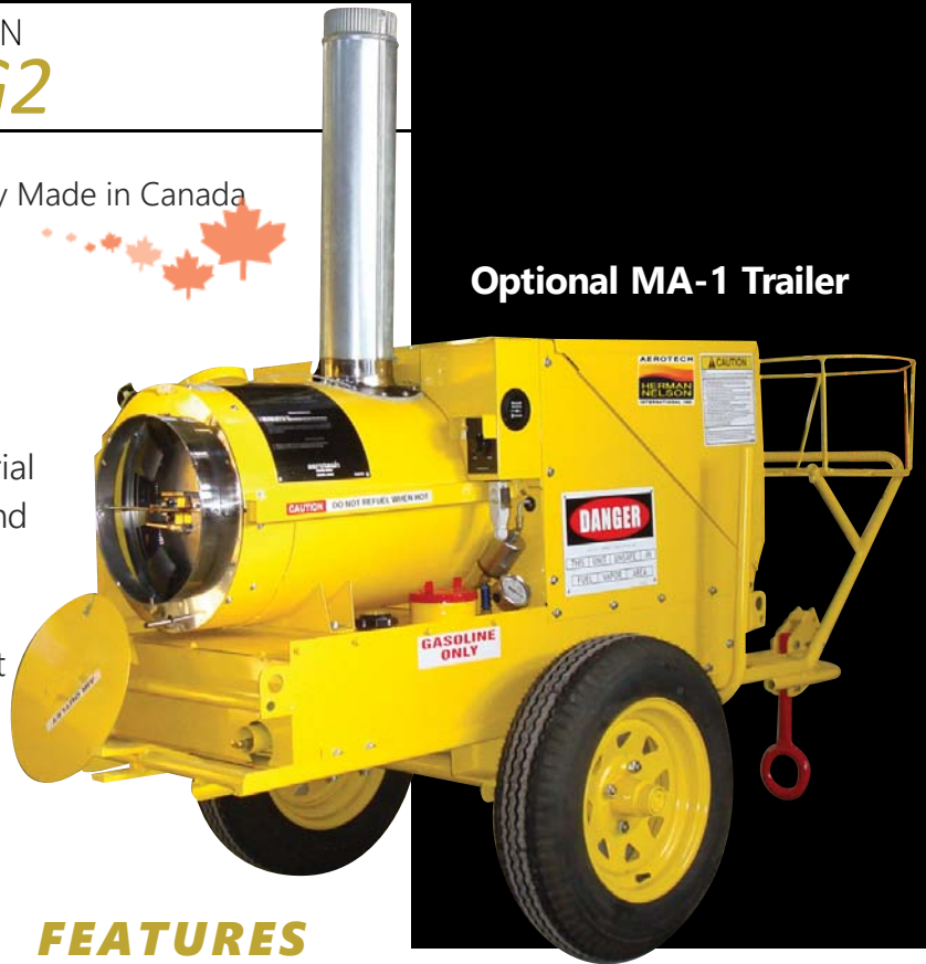
Optional MA-1 Trailer