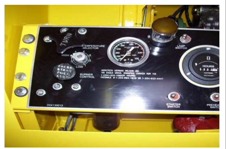
BT400 NEX-G CONTROL PANEL